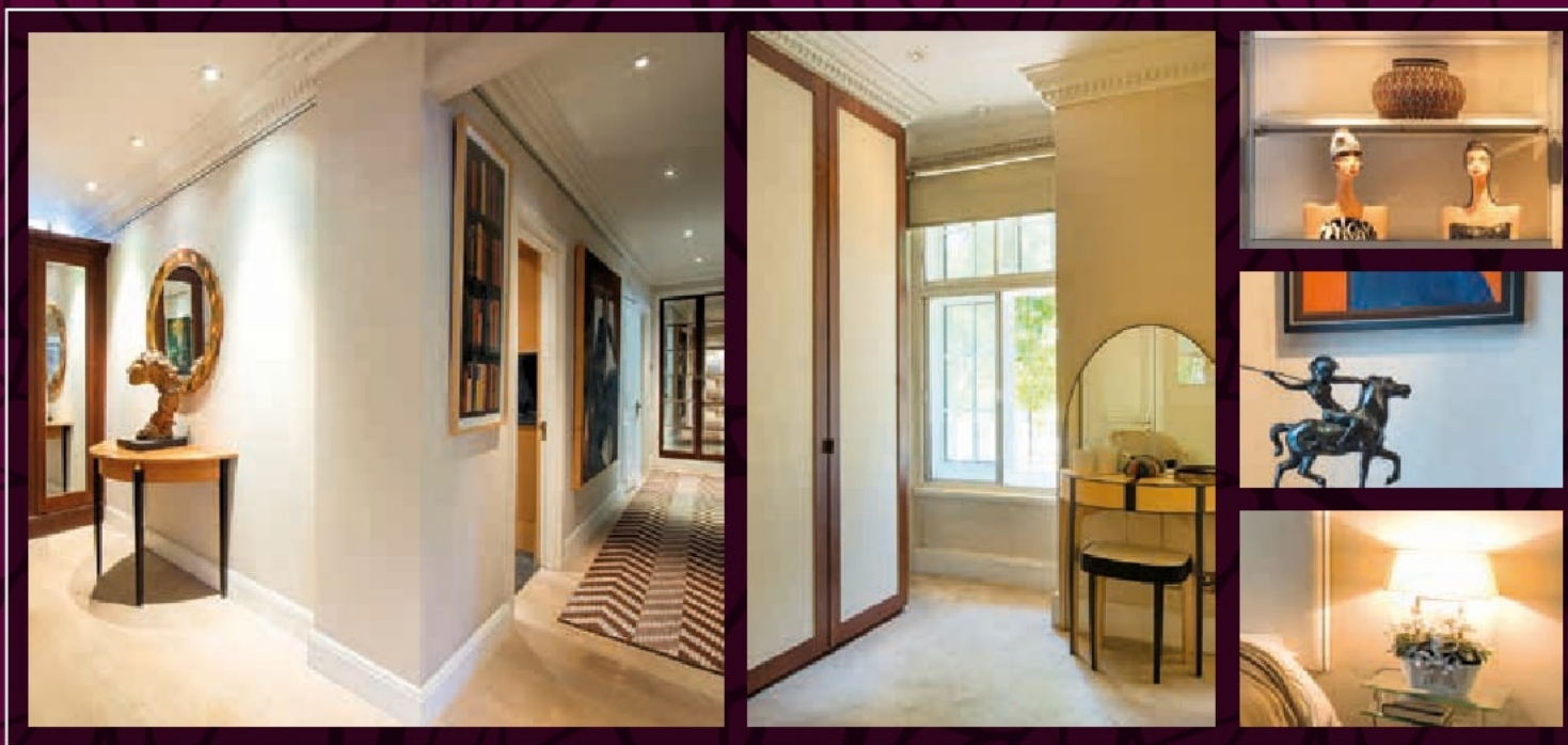
Aldford House Mayfair W1